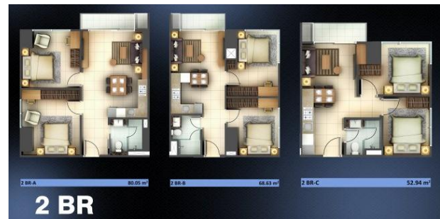
Fig. 2 Apartemen Bintaro Plaza Residences

Comparing two study cases of small type house (TABLE II), we found the similarities and differences of the building. Both Permata Bintaro and Bintaro Plaza Residences have similar building area (36 square meters). The differences shown by arrangement of their lay out of each units. The bedrooms of apartment unit is adjacent to each other, but two bedrooms at Permata Bintaro divided by a bathroom. The kitchen at Permata Bintaro placed on outside of the building, while the kitchen at the apartment integrated with the dining room. The parking area (carport) at Permata Bintaro placed on front yard of building, while parking area at Bintaro Plaza Residences separated with the apartment unit. The parking ratio for the apartment is 1:5 (1 parking area:5 units apartment). Permata Bintaro built on 72 square meters land area that means the owners are very likely to do some building expansion in the front yard and back yard. Meanwhile, the inhabitants of Bintaro Plaza Residences can not expand their building area because of their limited unit area.