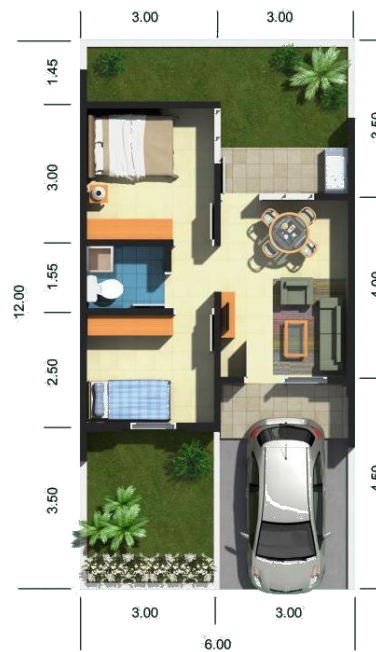
Fig. 1 Permata Bintaro Housing

Meanwhile on different period (1995 - 2015) in the same category is represented by Bintaro Plaza Residences Apartment [1]. It has three types of apartment units, that are studio type, one bedroom type, and two bedrooms type. The two bedrooms is taken as a case study because it has a similarity of building area with Permata Bintaro housing (36 square meters) although the Bintaro Plaza Residences has various of area unit (between 28 to 36 square meters). Hence, these units in the apartment are classified as small type which has two bedrooms, living room integrated with kitchen and dining room, one bathroom and balcony. This apartment accommodates parking area for its residents on parking floor.