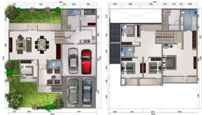
Fig. 6 Kebayoran Housing

Meanwhile on different period (1995 – 2015) in the same category is represented by the premium cluster of Kebayoran housing [7] with 255 square meters of building area built in 282 square meters of land area. Fig. 6 shows the arrangements of space which consists of five bedrooms plus one maid’s bedroom, three bathrooms plus one maid’s bathroom, living room, one kitchen, front and back terraces, three balconies and a garage for two cars and carport for two cars.