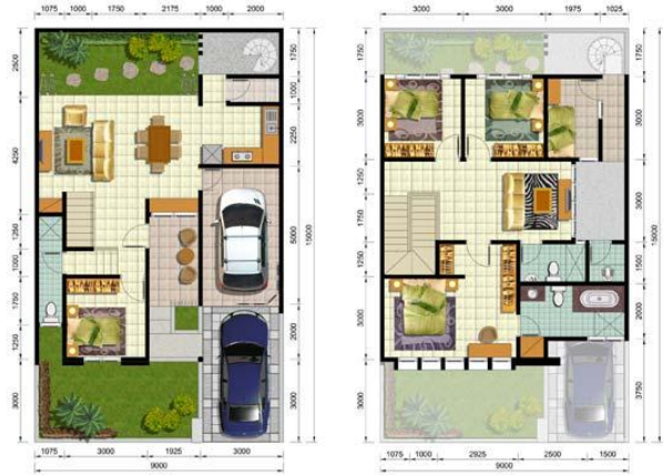
Fig. 4 Discovery Housing

Meanwhile on different period (1995 – 2015) in the same category is represented by Discovery housing [6] with the 161 square meters of building area built in 135 square meters of land area. The Fig. 4 shows that the lay out arrangement of Discovery has four bedrooms plus one maid bedroom, three bathrooms and plus one maid bathroom, drawing room located on the front terrace, dining room integrated with living room, one kitchen, and carport for two cars capacity.